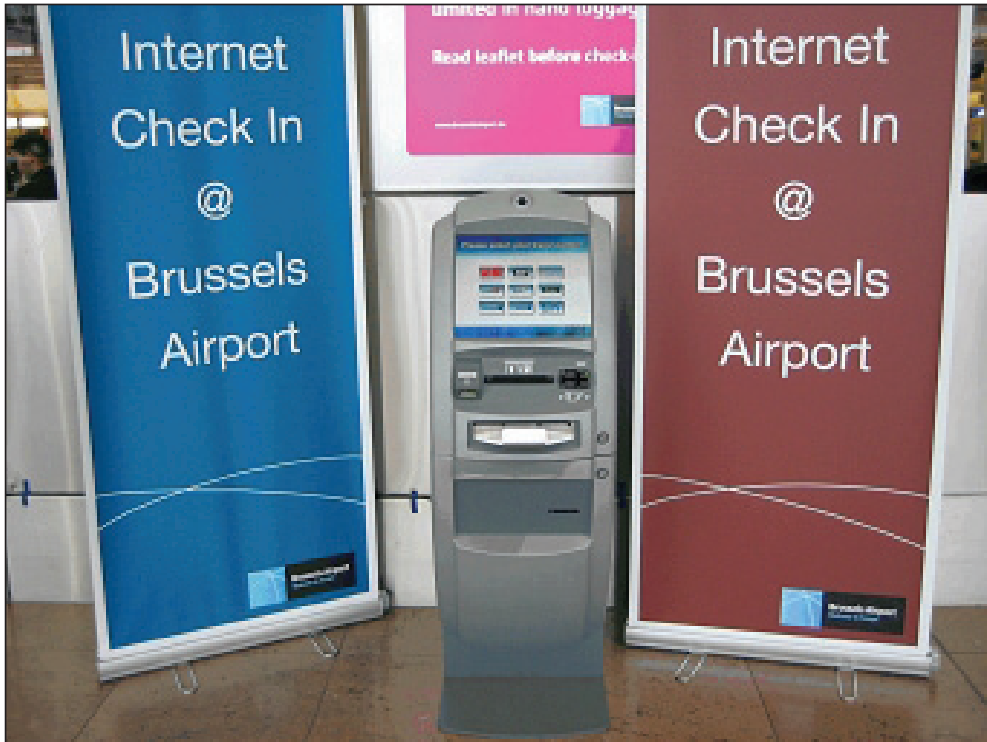
Internet kiosk - Brussels Airport

IBM has installed the first Internet check-in kiosk at Brussels Airport, in a trial set-up.