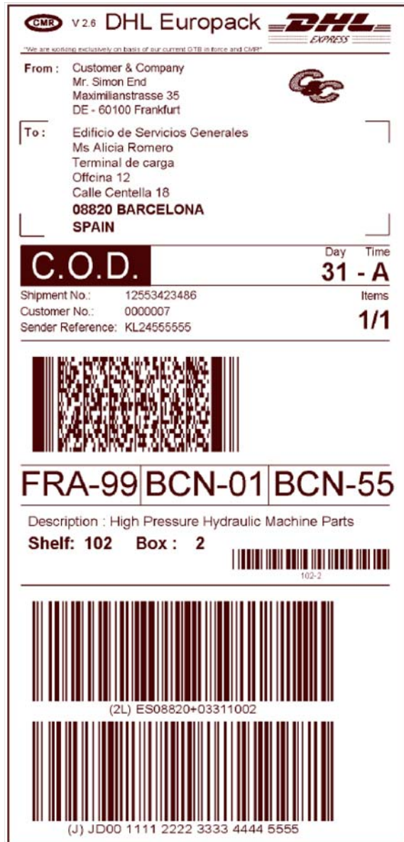
Figure 3 : DHL Example of a Shipping Label

Note: the following examples are for reference only and do not reflect real examples of IBM freight using a carrier specific label.