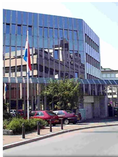
CIE Headquarters in Luxembourg

The prototype's general design is based on a thin client three-tier architecture, Websphere Application Server 3.02 servlets, and uses the Common Connector Framework (CCF) to access CICS applications. Integral to the CCF is the CICS Transaction Gateway (CTG), the Java connector for CICS.